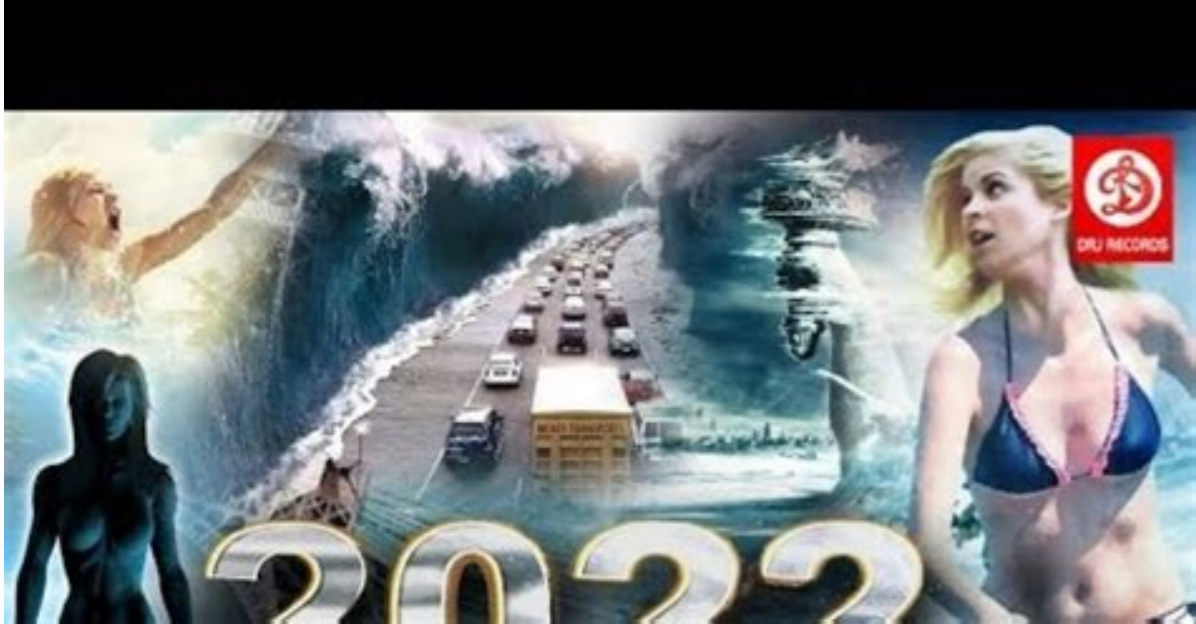
Hollywood movies released in 2022. Hollywood movie tsunami 2022 hindi dubbed.